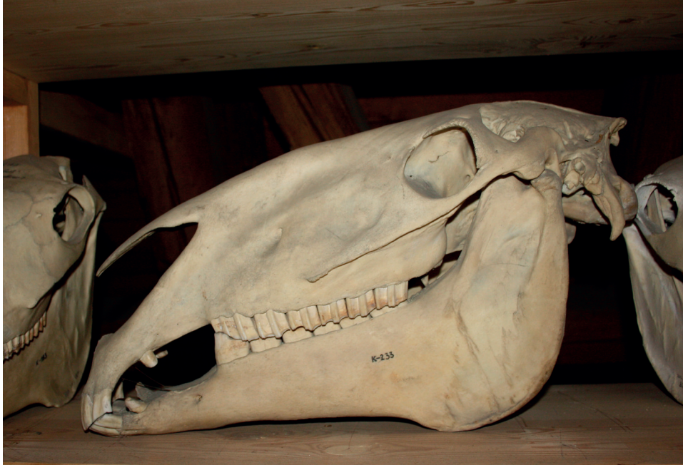
Hippological Museum Slatiňany contains rich material of Kladruber horse (skull n. HMS 233 - Black Kladruber)