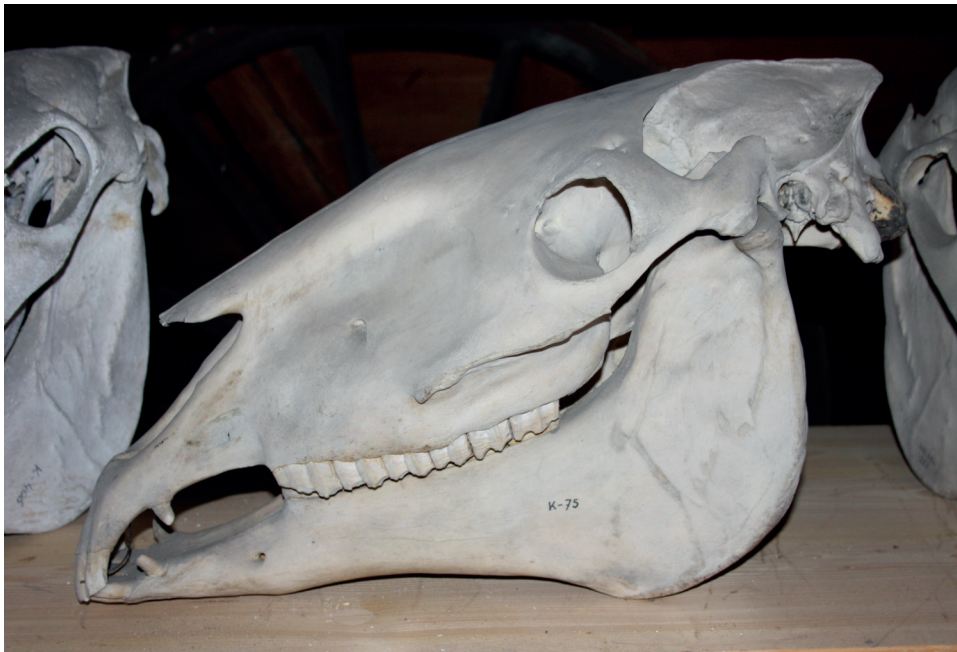
Skull n. HMS 45 - White Kladruber).